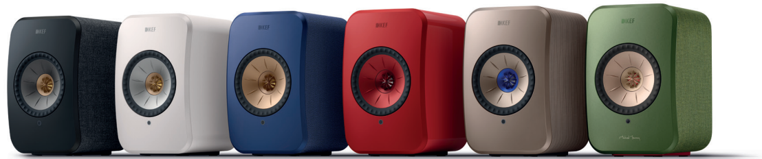
Carbon Black Mineral White Cobalt Blue Lava Red Soundwave by Terence Conran Edition Olive Green